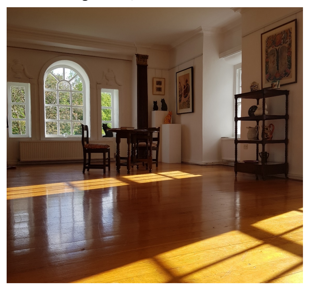
The East Landing, Plas Brondanw